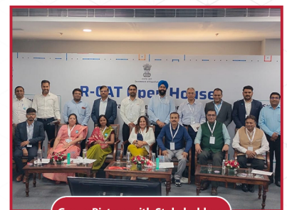
Group Picture with Stakeholders